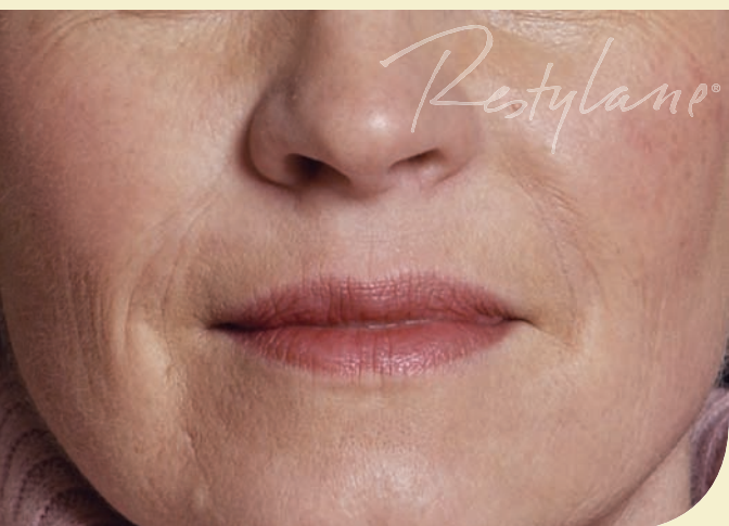
After treatment with three Restylane ® 0.7 mL syringes