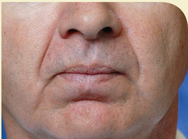
Nasolabial folds before treatment