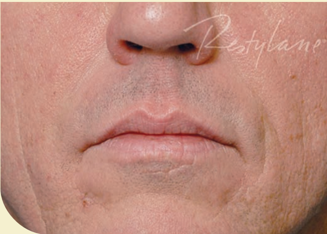
After treatment with two Restylane ® 1 mL syringes