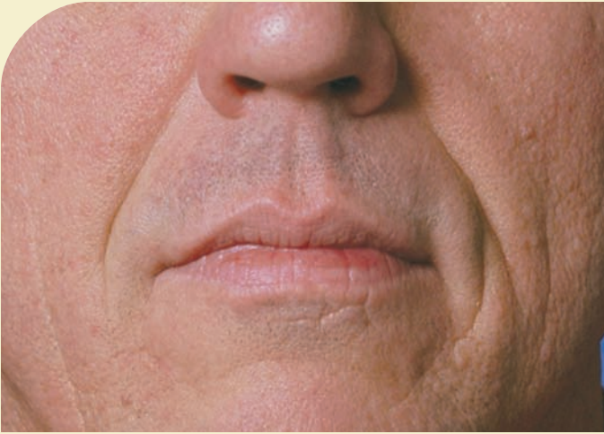
Nasolabial folds before treatment