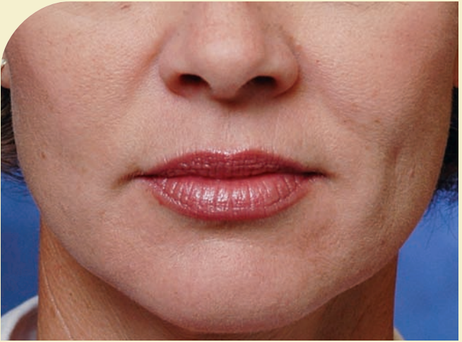
Nasolabial folds before treatment