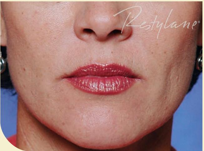
After treatment with two Restylane ® 1 mL syringes