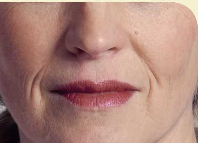
Nasolabial folds before treatment